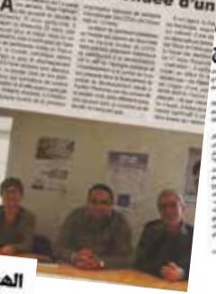
Le tour de Vendée d'un