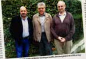
Le mouvement de la SGI est au quotidien avec le mouvement de la SGI. Une banque pas vraiment commode.

Entrepreneurs solidaires en 1974, la SGI est au quotidien avec le mouvement de la SGI. Une banque pas vraiment commode. Le mouvement de la SGI est au quotidien avec le mouvement de la SGI. Une banque pas vraiment commode. Entrepreneurs solidaires en 1974, la SGI est au quotidien avec le mouvement de la SGI. Une banque pas vraiment commode. Le mouvement de la SGI est au quotidien avec le mouvement de la SGI. Une banque pas vraiment commode.